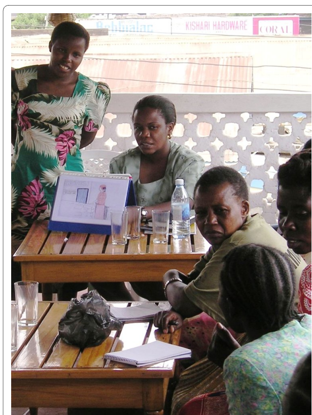
Figure 2 Reviewing an early version of the pictorial flipchart with CAC members.

These findings led to a reappraisal of informed consent procedures at the site, culminating in a variety of new approaches being tested in the MDP301 Pilot Study, including a pictorial flipchart developed through consultation with members of the Community Advisory Committee (Figure 2) and subsequently used by project fieldworkers to provide information to potential study participants at facility-based community meetings. Audio tape recordings and pictorial instructions providing information on gel use were also piloted. A site-specific comprehension assessment, which included a qualitative component and a standardised written checklist, was used to evaluate how accurately study participants were able to retain key messages relating to pilot study objectives. IDIs were conducted in order to explore comprehension and message retention in more depth. The high levels of information retention and comprehension observed during the pilot study led to a revised package of informed consent tools and procedures being taken into the main MDP301 phase III clinical trial.