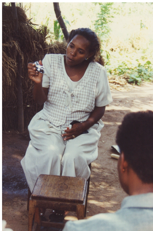
Figure 1 Fieldworker showing a speculum to women attending a facility-based meeting.

The relatively high early losses to follow-up observed during the feasibility study[25], coupled with anecdotal feedback from clinic staff and fieldworkers, and information collected from study participants in community participatory workshops, focus group discussions (FGDs) and in-depth interviews (IDIs) [34], suggested that mis-