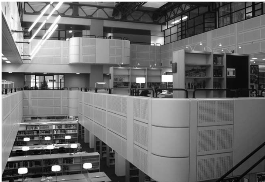
Overview of the reading room of the Royal Library. To attract more visitors, in 2007 the Royal Library opened a large reading room concentrating on Dutch culture and history and related subjects.

the 17th century, the art of the Italian Renaissance, and modern art and architecture. But currently it is no longer possible to collect exhaustively in specialised subject areas such as applied arts and non-western art at Leiden University, iconography at Utrecht University or the theory of art at the University of Amsterdam. Even the Royal Library has had to focus less broadly: since the year 2000 its collection policy has narrowed to Dutch culture and history and related subjects.