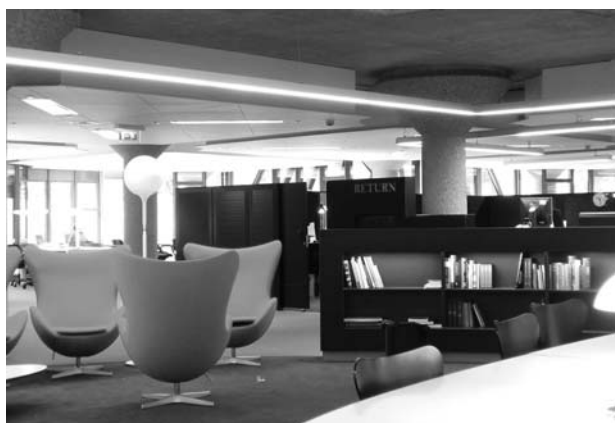
Information centre of the library of Leiden University. The information centre opened in April 2009. Part of the centre is a consulting room for visitors and subject librarians.

It is very likely that the physical art historical