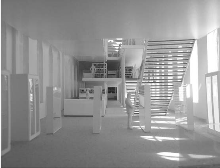
Artist's impression of the new Humanities Library at Utrecht University. Photo: Website Utrecht University, architects Grosfeld van der Velde.

combined main and faculty library (as at Leiden University). In anticipation of a new campus on the Amsterdam business centre ZuidAs, VU University is planning to centralise all arts and humanities libraries in a new location within the main VU building. The TU Delft was forced to move its architecture library into another building because of a devastating fire on 13 May 2008, which ruined the building but left the library collection almost undamaged. 3