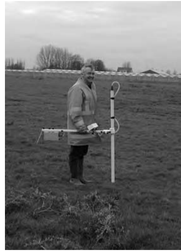
Figure 13 A Geoscan fluxgate gradiometer with 0.5 meter sensor separation (left) and a Bartington fluxgate gradiometer with 1 meter sensor separation (right).

The two fluxgate sensors are placed 0.5 meter apart in a lightweight aluminum or plastic case (Fig. 13). The magnetometer is carried with the sensors in a vertical alignment, and is sensitive to the vertical component of the earth's magnetic field. The sensitivity of the instrument is 0.1 nT. The data quality strongly depends on the quality of the instrument setup, a procedure that is partly manual, partly electronic. The data that is collected is automatically displayed and recorded in the instrument's memory. For this study, sites on which a Geoscan instrument was used were divided into 20 x 20 meter grid squares. Data was usually collected every 0.25 meter on lines with a 1 meter line separation, unless stated differently in the fact sheets (Appendix I). An automated trigger was used and grids were walked in a zigzag fashion. A setup and zeroing was performed each time before commencing a new grid, in order to optimize the data quality. The data was downloaded each day to a laptop computer with the Geoplot program.