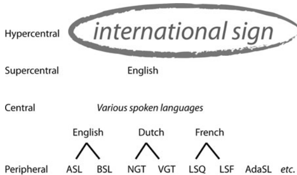
FIGURE 3. A global model of communication strategies used by deaf people.

between cultures, the larger the chances will be that there are shared norms and metaphors, familiar objects, and so on that can be involved in creating new signs or descriptions on the spot, thus facilitating interaction, and in doing so, generating what is known as international sign.